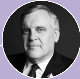
Hon. David Onley